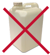
No Fats, Oil, or Grease