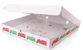
Food Scraps, Including Egg Shells, Meat & Bones, Pizza Boxes, Cardboard Egg Cartons & Food-Soiled Paper, Coffee Grounds

Please take used cooking oil to the West Sacramento Public Works Corporation Yard at 1951 South River Road (M-F, 8 a.m. to 3 p.m.)