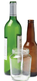
Glass Bottles & Jars (Even broken)