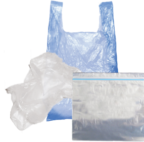
Plastic Wrap, Bags & Other Plastic Film