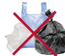
No Plastic Bags, Plastic Coated Bags or Plastic of Any Kind