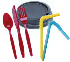
Cup Lids, Plastic Utensils, Plastic Straws (Including Compostable)