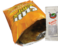
Snack & Chip Bags, Candy Wrappers & Condiment Packages