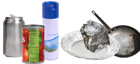
All Metal Beverage & Food Cans, Empty Aerosol Cans, Clean Aluminum Pans & Foil, Small Scrap Metal (Up To 20 Pounds)