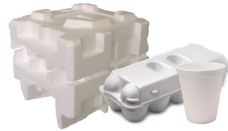
Polystyrene Foam & Packaging (Including Foam Egg Cartons)