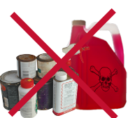
No Hazardous Waste Contact Yolo County at (800) 207-8222