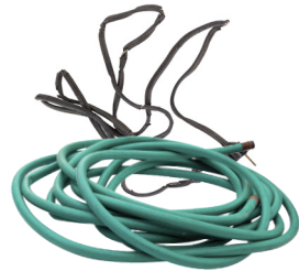
Hoses, Cords & Wire