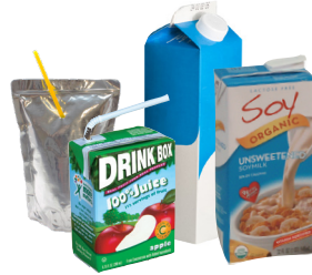
Beverage Pouches & Aspectic & Gable-Top Cartons