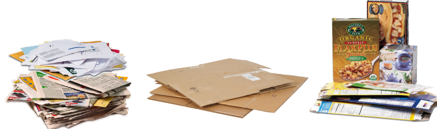
Clean Paper, Magazines, Newspaper, Junk Mail, Cardboard, Cardboard Egg Cartons, Cereal Boxes

Please do not bag recyclables, keep loose. Please empty all containers prior to recycling.