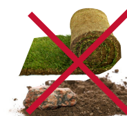
No Dirt, Rock, or Sod