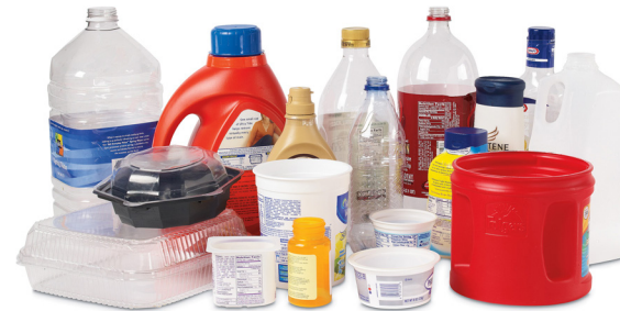
Empty Plastic Bottles, Rigid Plastic Containers, Plastic To-Go Containers