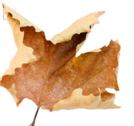
Grass, Weeds, Green Plants, Tree Limbs, Wood Chips, Dead Plants, Brush, Garden Trimmings, Leaves, Cut Flowers (Please place palm fronds, yucca and cacti in the Trash)