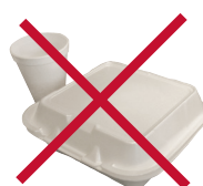
No Polystyrene Foam